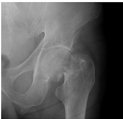
Femoral neck fracture

endoprosthesis provides no advantage in quality of life and functional outcomes. Total hip arthroplasty is the treatment of choice in patients who have advanced arthritic changes in the acetabulum. The disadvantage to total hip arthroplasty treatment is related to stability. There is a significantly decreased dislocation rate with endoprosthesis placement compared to total hip arthroplasty.