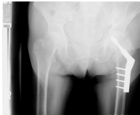
Fixation of intertrochanteric femur fracture