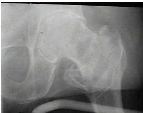
Intertrochanteric femur fracture

Treatment of intertrochanteric femur fractures once again is based on displacement and can range anywhere from nonoperative to operative care. Nonoperative treatment in both femoral neck and intertrochanteric femur fractures is only indicated in the most medically unstable and non-ambulatory patients. With nonoperative treatment, the risk of secondary medical complications, such as DVT, pneumonia, and decubitus ulcers and places the patient at significant risk. Operative treatment of intertrochanteric fractures requires anatomic reduction for optimal outcome. Implant choices range anywhere from an intertrochanteric nail to compression hip screw with side plate, to a calcar-replacing total hip arthroplasty. Treatment with compression hip screw is the most common implant currently, however, intramedullary nails are becoming more popular. Total hip replacement in intertrochanteric fractures is much less predictable than in femoral neck fractures, so this is a last choice option. Given the elderly population in which this occurs, there are some arguments for bone reinforcement with substances like calcium phosphate cement paste and cement used for joint replacement surgery.